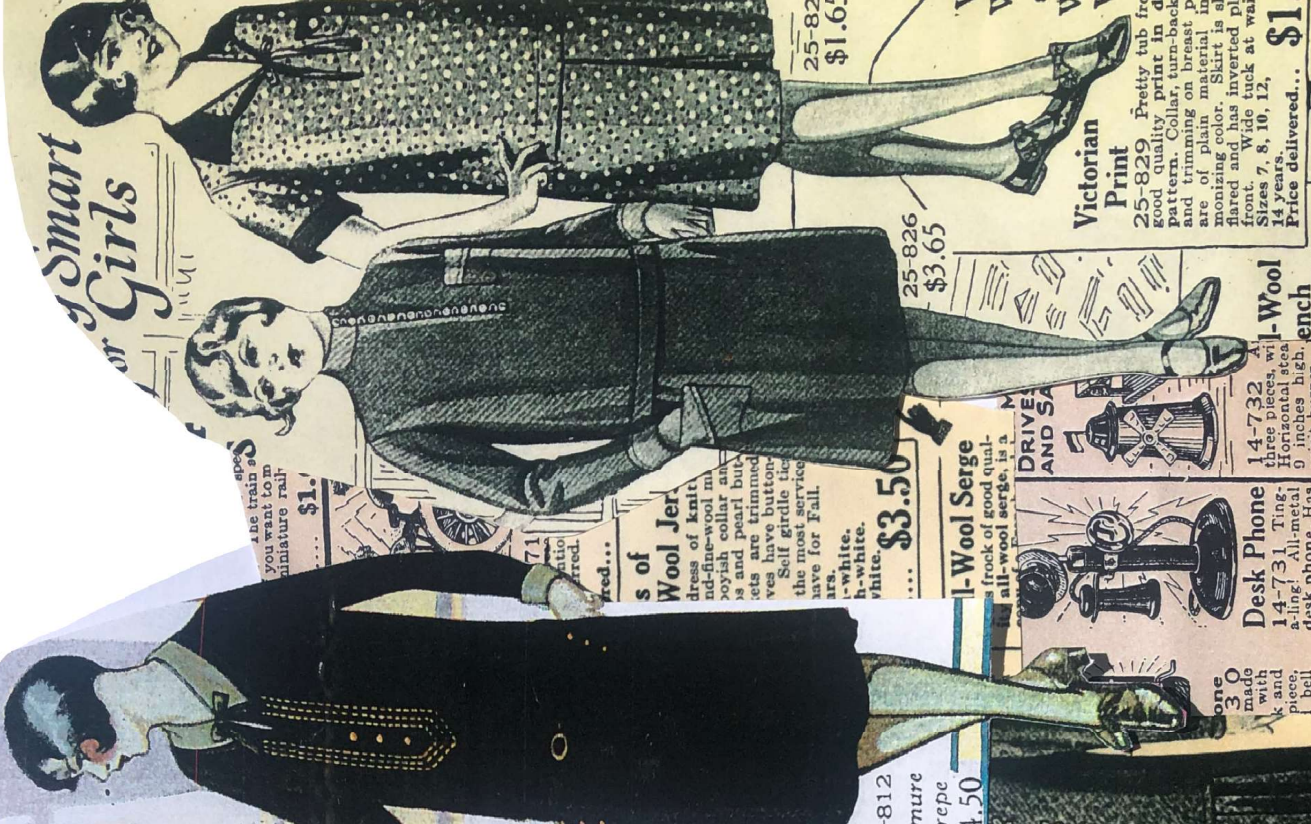
Wool Jersey $3.50