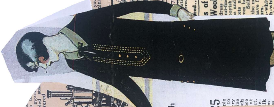
17-812 Armure Crepe $4.50