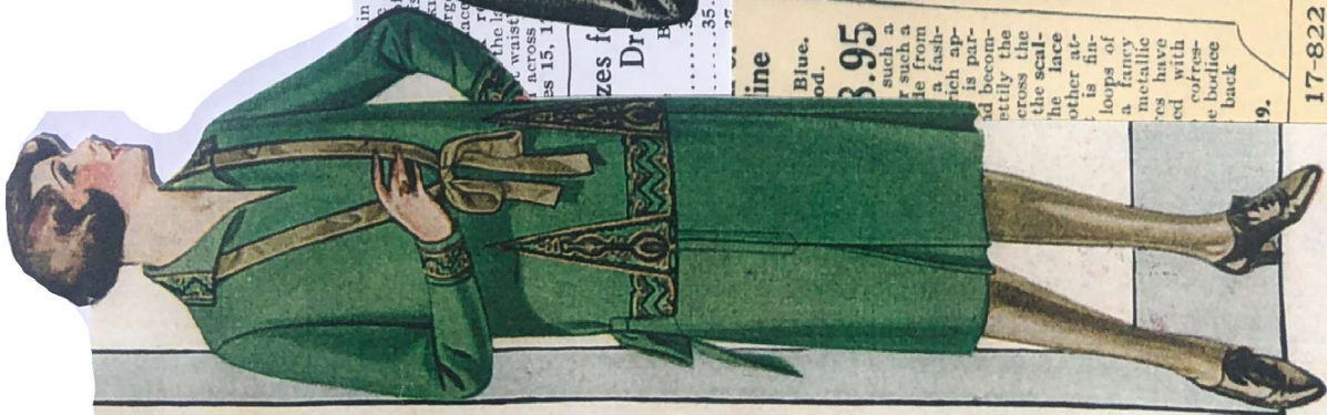
Embroidered All-Wool French Flannel 17-8222 Crepe Armure $4.95