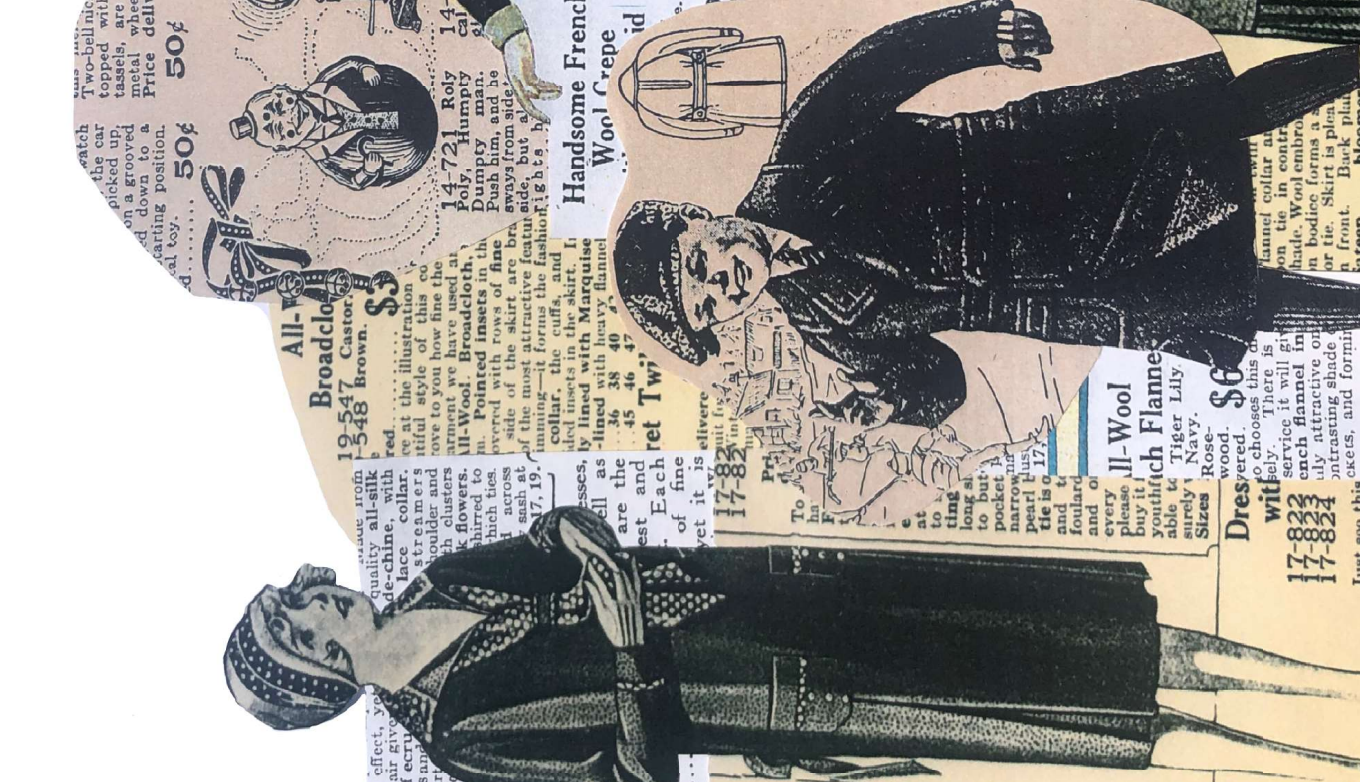
Il-Wool Tiger Lily Flannel 17-8223 17-8224 Dressed. wool. $6